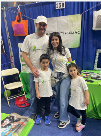
The Launer Family